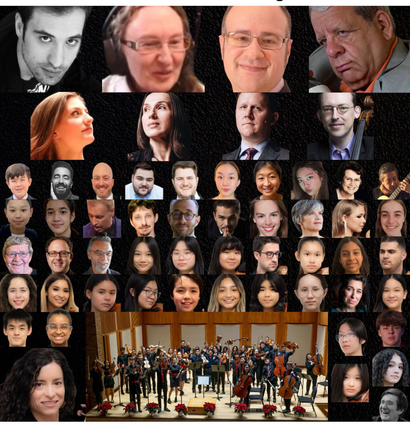
Monday April 1, 2024 @ 7:00pm